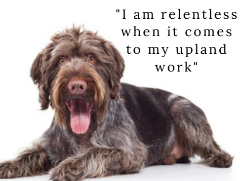
GERMAN WIREHAIRED POINTER