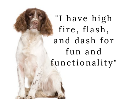
ENGLISH SPRINGER SPANIEL