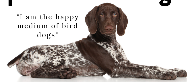
WIREHAIRED POINTING GRIFFON

"I am the 4wheel-drive truck of the bird dog fleet"