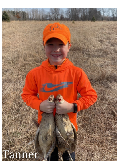
We are looking forward to seeing all the great photos of the next generation of hunters!