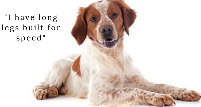
"I check all the boxes when it